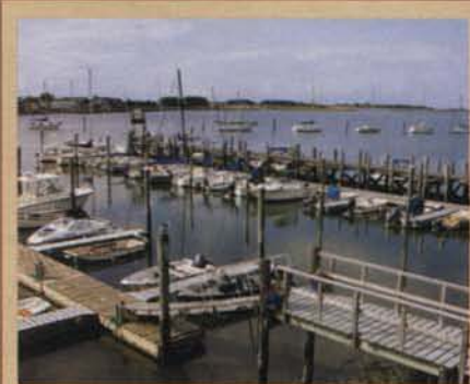
Port Clinton Marina is planning to increase its number of slips.